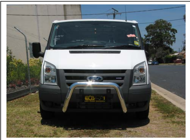
Figure 5 – Front view shown