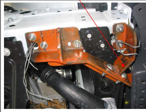
Figure 3 – Driver's side shown