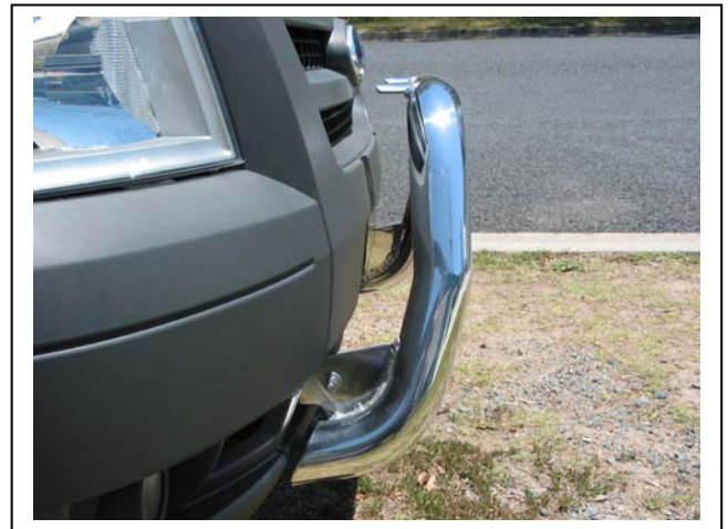
Figure 6 – Side view shown