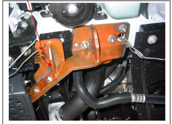
Figure 4 – Passenger side shown